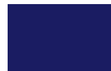
717 Grand Slam