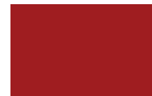
721 Relay Red